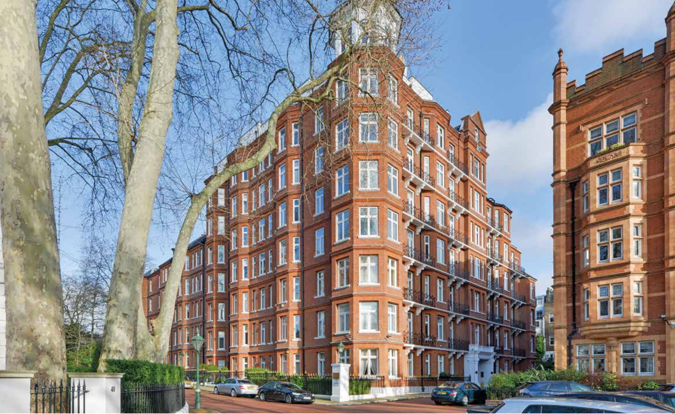
HYDE PARK GATE | KENSINGTON SW7