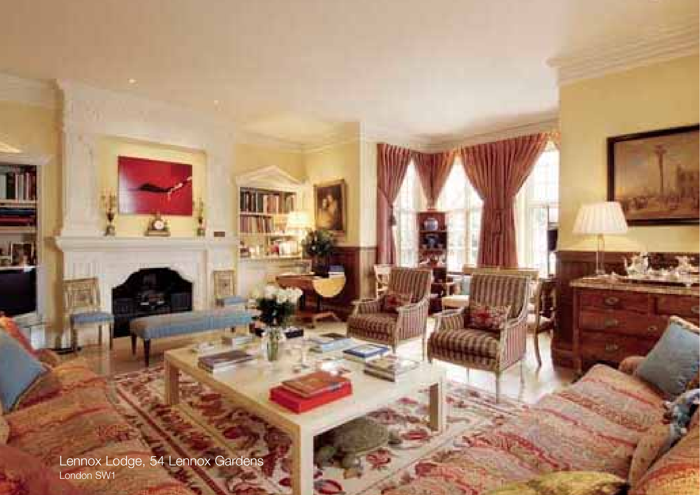
Lennox Lodge, 54 Lennox Gardens London SW1